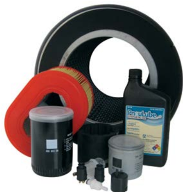
PARTS KIT (20350) ISUZU ENG, VEU 854 MAINTENANCE PARTS FOR VEU