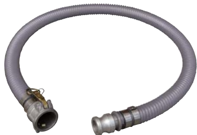
5' HOSE (19049)