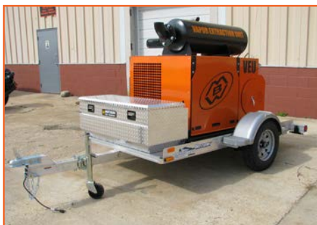
TRAILER KIT (20357)