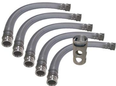
MAN HOLE KIT (19874) 20' OF 3" HOSE IN 4' SECTIONS W/ COUPLERS & SAFETY NOZZLE