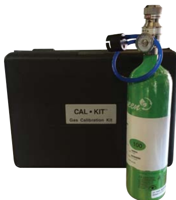
SENSOR CALIBRATION KIT (19279)