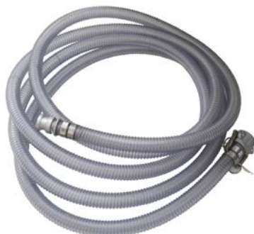
25' HOSE (19050)