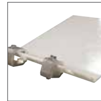
OPTIONAL UHMW PAD