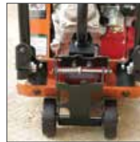
OPTIONAL WHEEL KIT