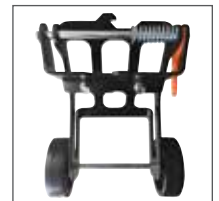
OPTIONAL WHEEL KIT