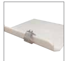
OPTIONAL UHMW PAVING PAD FOR INTERLOCKING PAVING BLOCKS