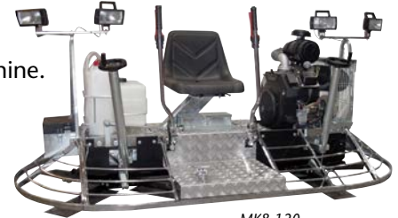
MK8-120 Manual Steering

A manual steer, 31 hp, 8 foot machine. Our most popular North American model. High-speed rotors, low center of gravity, superior lines of sight, protected drive train and easy to service. Another workhorse in floating or finishing applications.