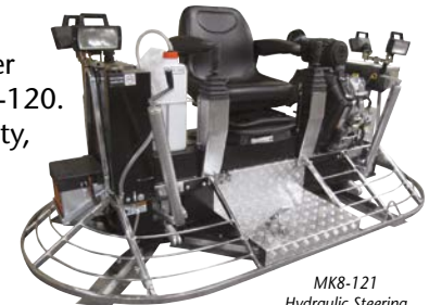
MK8-121 Hydraulic Steering

Also a high-speed, but a hydraulic steer version of the MK8-120. Low center of gravity, ease of operation and service. A low maintenance, long lived product.