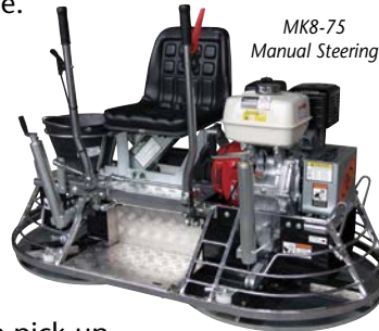
MK8-75 Manual Steering

MK8-75 is the industry's smallest ride-on trowel. Perfect for large or small jobs, multi-story flooring and as a compliment to large machines that just can't operate in tight areas. This 460 lb. rider transports in the bed of a pick-up, passes through a 32" doorway and can be used as an edging trowel. Floats and finishes with equal proficiency.