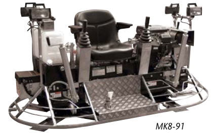
MK8-91 Hydraulic Steering

The industry's only hydraulic steer, 23.5 hp, 6 foot machine. Same basic design as MK8-90, but hydraulic steering reduces operator fatigue on long duration applications.